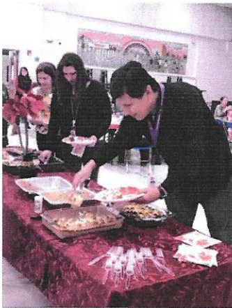
Rodriguez Elementary School faculty and staff enjoy a holiday brunch courtesy of PART Austin