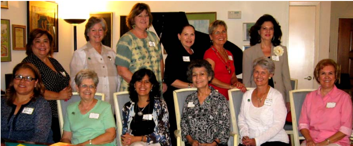
Table Director Workshop in San Antonio