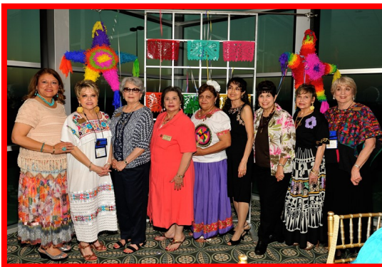
Upper Valley Table Directors & other VIPs