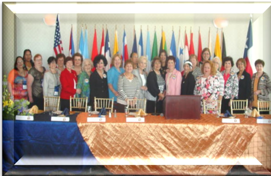
Eagle Pass Table Convention Hostesses

THANKS FOR A GREAT CONVENTION, EAGLE PASS!