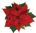
Members enjoy the 2012 Christmas Party held at Charcoal Grill.