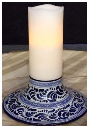
Convention Candle lit at General Assembly Meeting