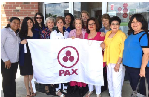
Dallas III members proudly display their Peace Banner on May 21, 2016 Meeting