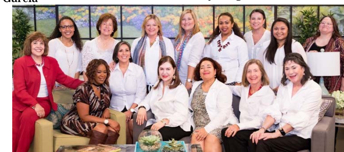
Houston Table members visit a local television show to promote the Houston PanAmerican Round Table history & vision.