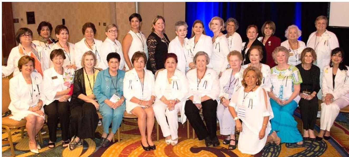
Alliance of the Pan American Round Tables Zone I Representatives