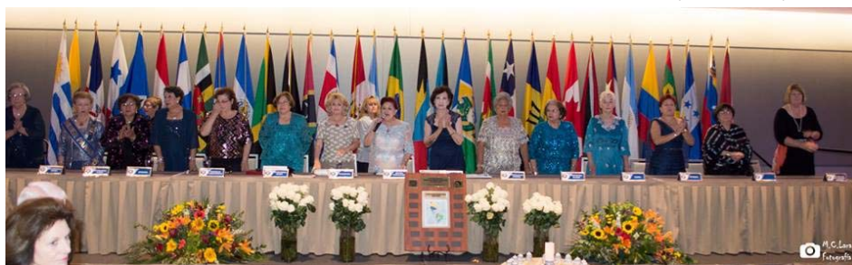
Alliance of Pan American Round Tables Directors 2014-2016