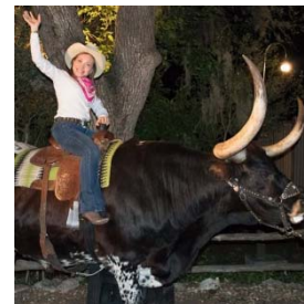
Cowgirl enjoying posing with steer at Texas Night Dinner