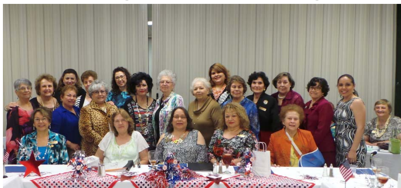
Eagle Pass members attend March meeting