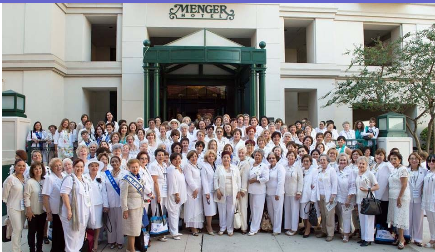
Alliance of Pan American Round Tables 35th Biennial Convention attendees of Hour of Memory Ceremony.