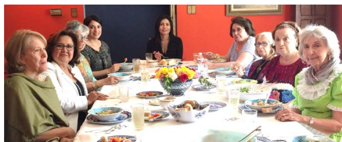
Dallas III members celebrate Pan American Day