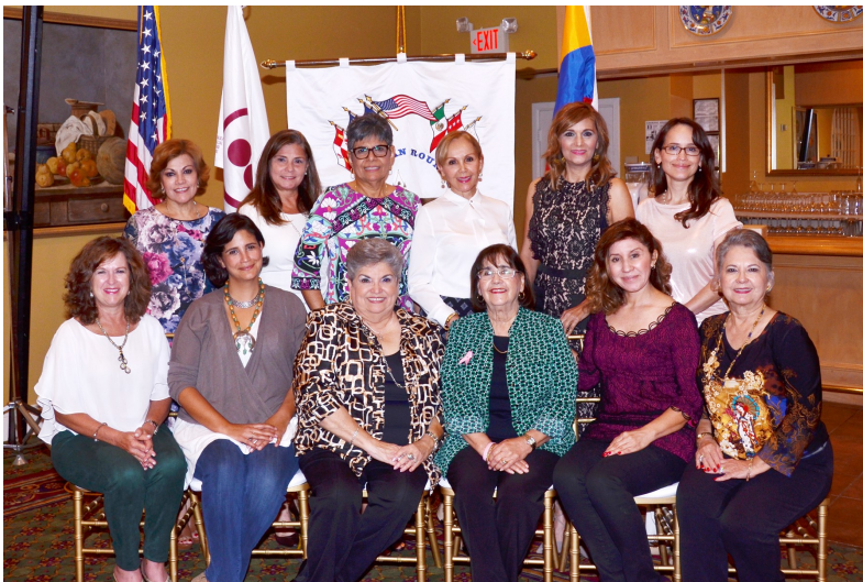
Laredo Table Officers 2015– 2017