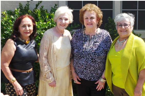
Founders Day Meeting— October 3, 2015