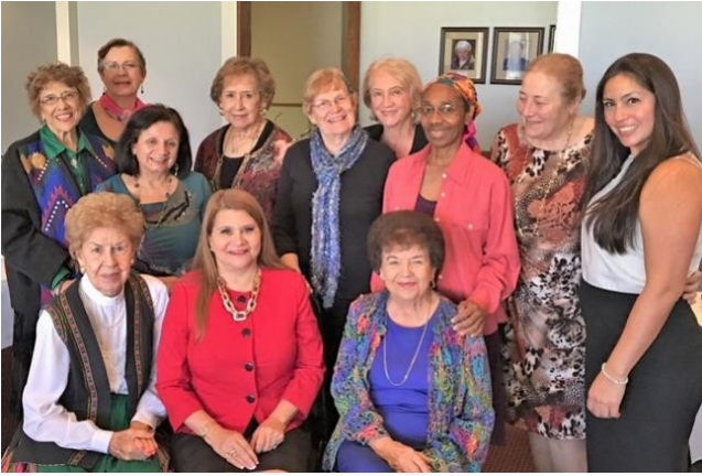
Board of Directors 2015-2016