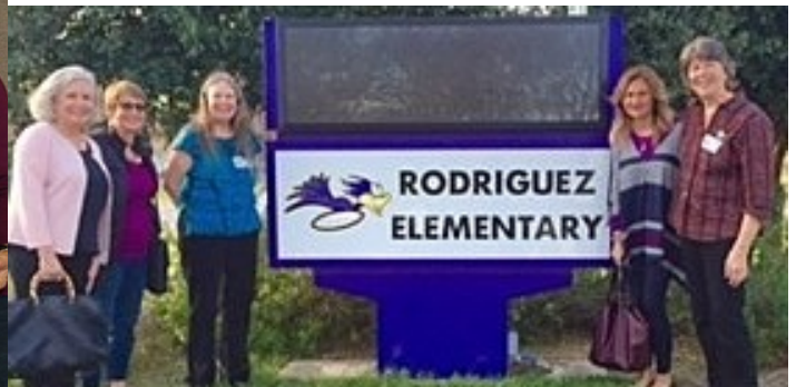
Austin Table members, part of the Outreach Committee at Rodriguez Elementary.