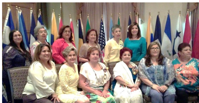
Rio Grande City/Roma members attend Observance Day in McAllen on April 2, 2016