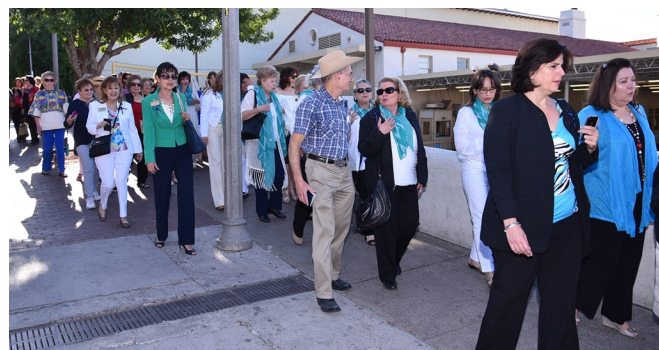
Pan American Round Table members, guests and dignitaries