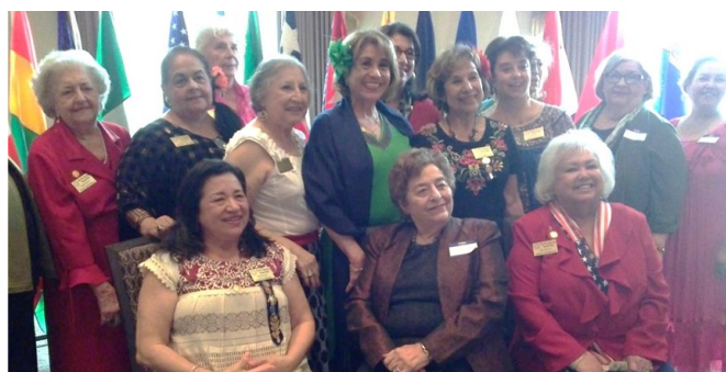
San Benito members attend Observance Day in McAllen